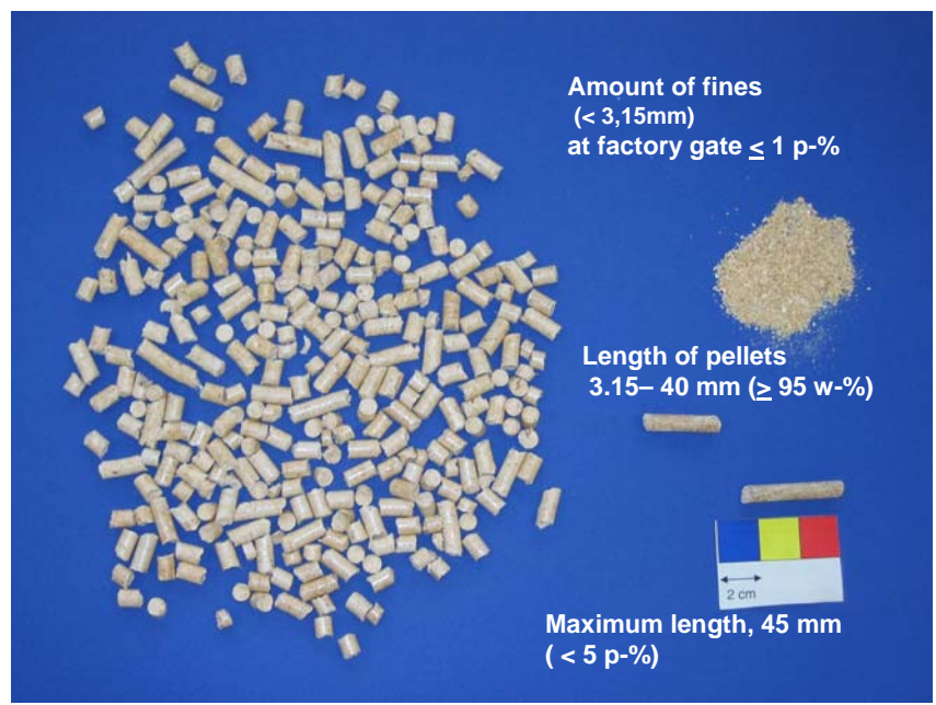
Fig 2. Dimensions of 8 mm wood pellets according to EN 14961-1.